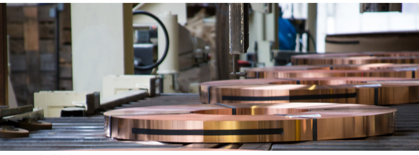
Flat Rolled Products

Europe and the US pushed refining charges upward. Aurubis utilized the good market situation and was able to fully supply its production facilities with input materials at very good refining charges during the past quarter.