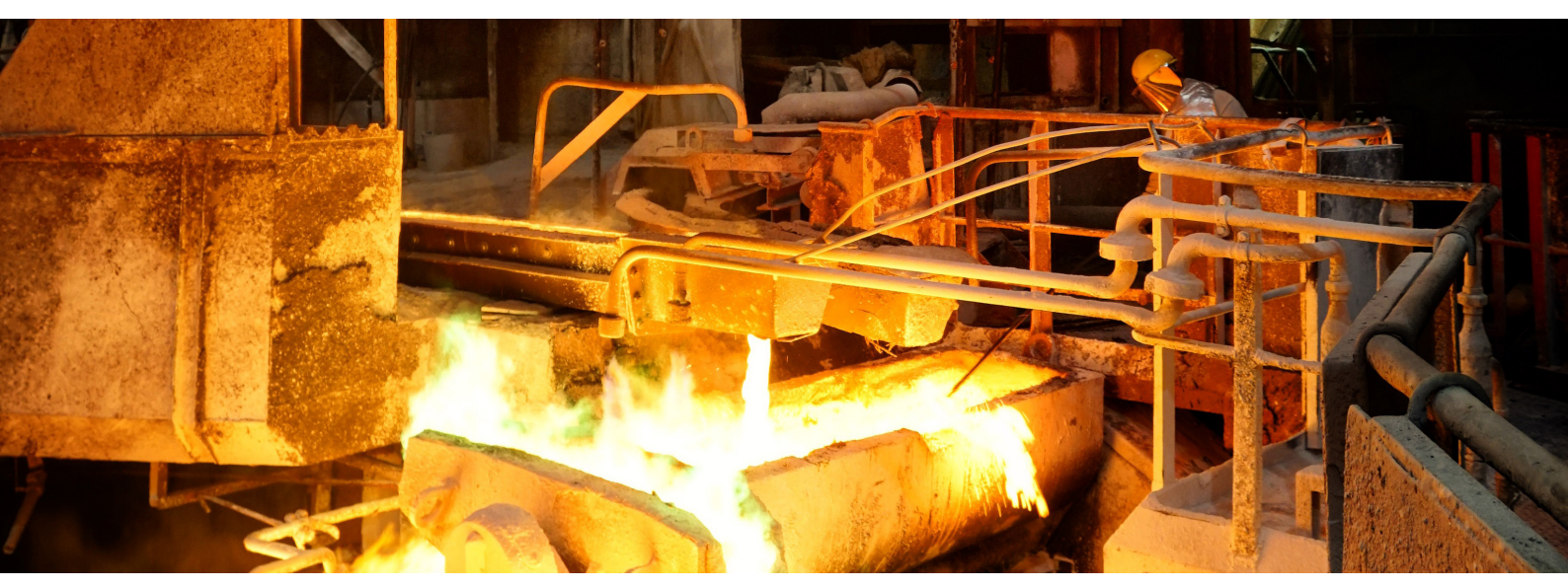
Metal Refining & Processing