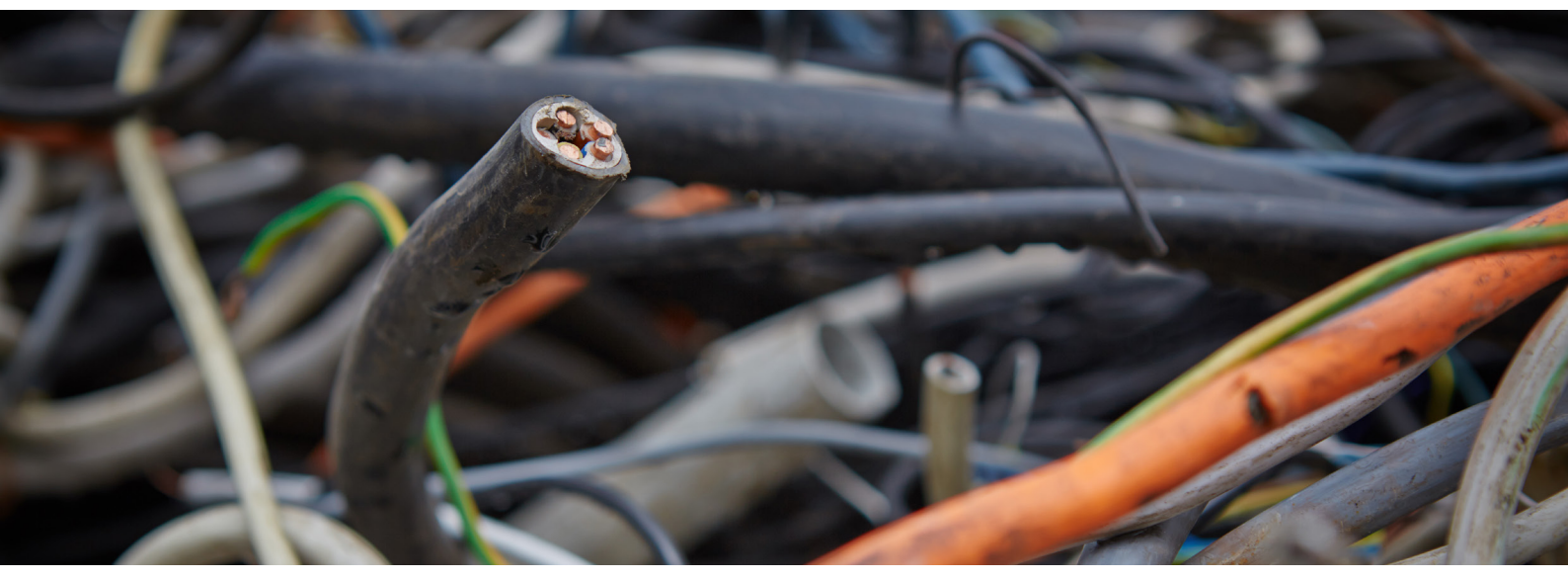
Cablo has specialized in recycling copper and aluminum cable since 1949.